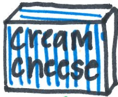
↑ cream cheese