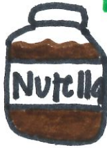
← Nutella ↑ blueberries